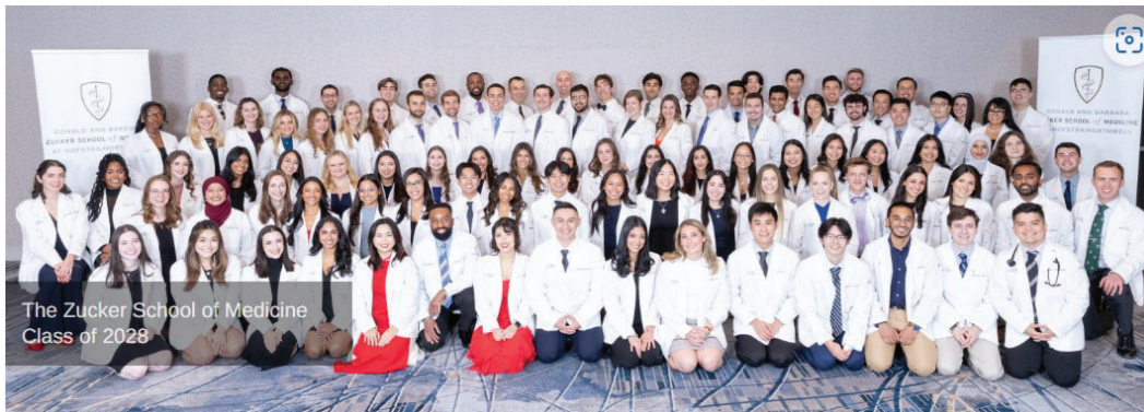
The Zucker School of Medicine Class of 2028